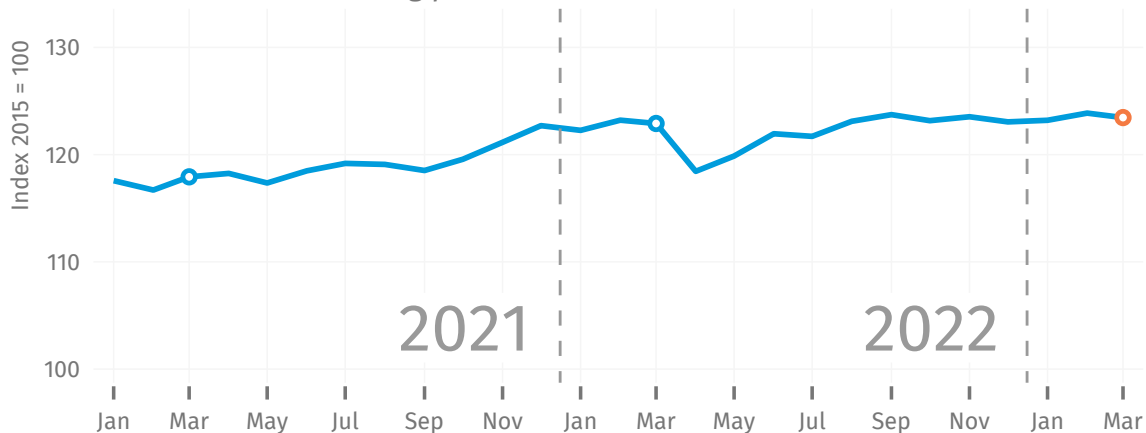
Global index of manufacturing production